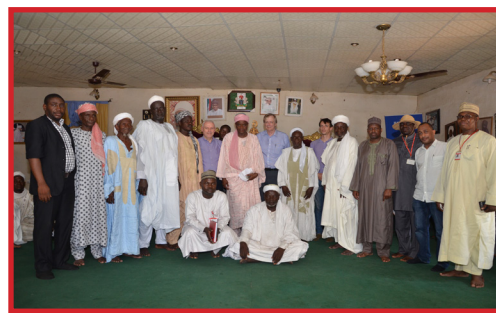
Group photo with the Zamfara State Traditional Council members at the Emir's palace