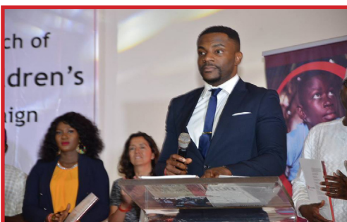
Nigerian Celebrity Compere, Obi-Uchendu Ebuka at the event