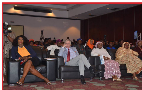
Nigerian Actress, Stephanie Linus Okereke at the event with other dignitaries