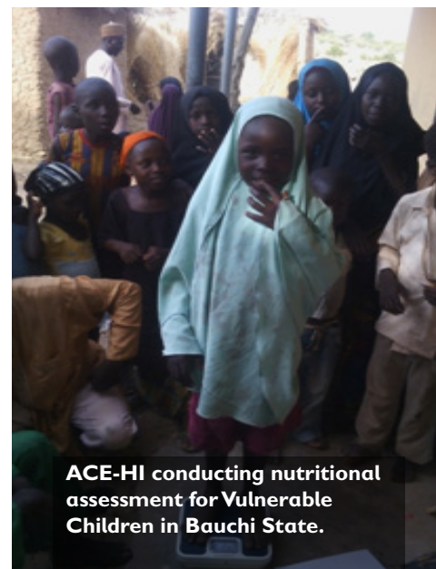
ACEHI conducting nutritional assessment for Vulnerable Children in Bauchi State.

ACEHI is one of the over 60 organizations whose organizational capacity have been improved and strengthened by the USAID-funded STEER project in Nigeria. With improved organization capacity, ACEHI hopes to access more grants in the future in order to implement more projects to benefit and improve the lives of children and community members in Bauchi state.