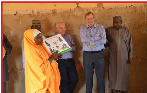
Country Director watches as a Community Volunteer educates nursing mothers