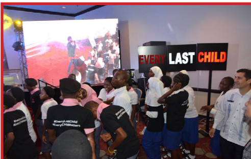
Child rights advocates dance at the global launch of EverlastChild campaign in Abuja