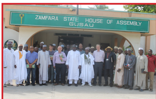
Zamfara State House of Assembly members in a group Photo with SCI team