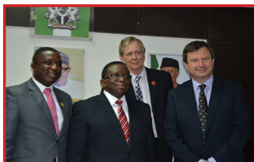
Hon. Minister of Health with Country Director and British Council representatives