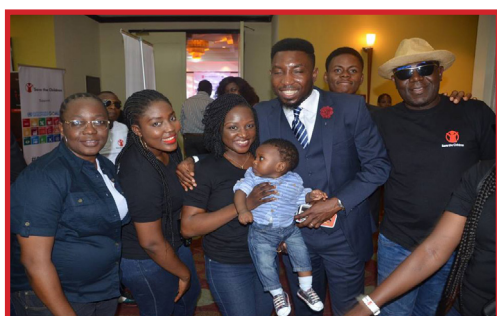
Save the Children Staff pose with celebrity Musician, Timi Dakolo