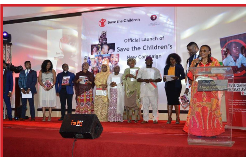
Celebrities and government functionaries launch the global report at the event