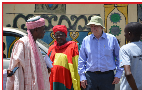
Country Director with the some chiefs at the Emir's palace