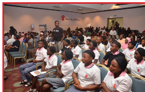
Cross section of students from GSS Gwagwalada at the event