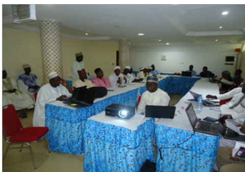
Sensitization Workshop for Representatives of Emirate Councils in the 5 WINNN Implementing States held in Kaduna

all the political wards in the 5 WINNN implementing states to enlighten the leaders on the importance and benefits of the MNCHW. In addition to this, WINNN deployed mobile teams for taking the services to identified hard to reach areas during the 2015 MNCHWs campaign rounds as well as the piloting of community dramas in Kebbi & Zamfara states during the 2015 November round of MNCHW.