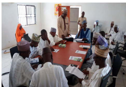
Members of BMS Code Compliance and Monitoring committee in a meeting in Zamfara State