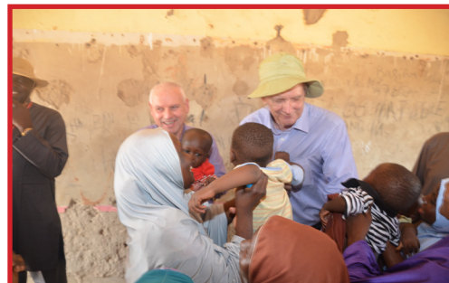
Country Director with beneficiaries of CDGP project