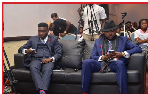
Nigerian Music Celebrities, Timi Dakolo and Banky W at the event