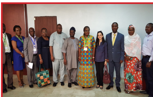
NAFDAC DG hosts Save the children team on an advocacy visit at NAFDAC head office