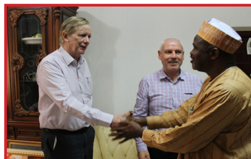
Deputy Speaker, Zamfara State House of Assembly recieving the Country Director