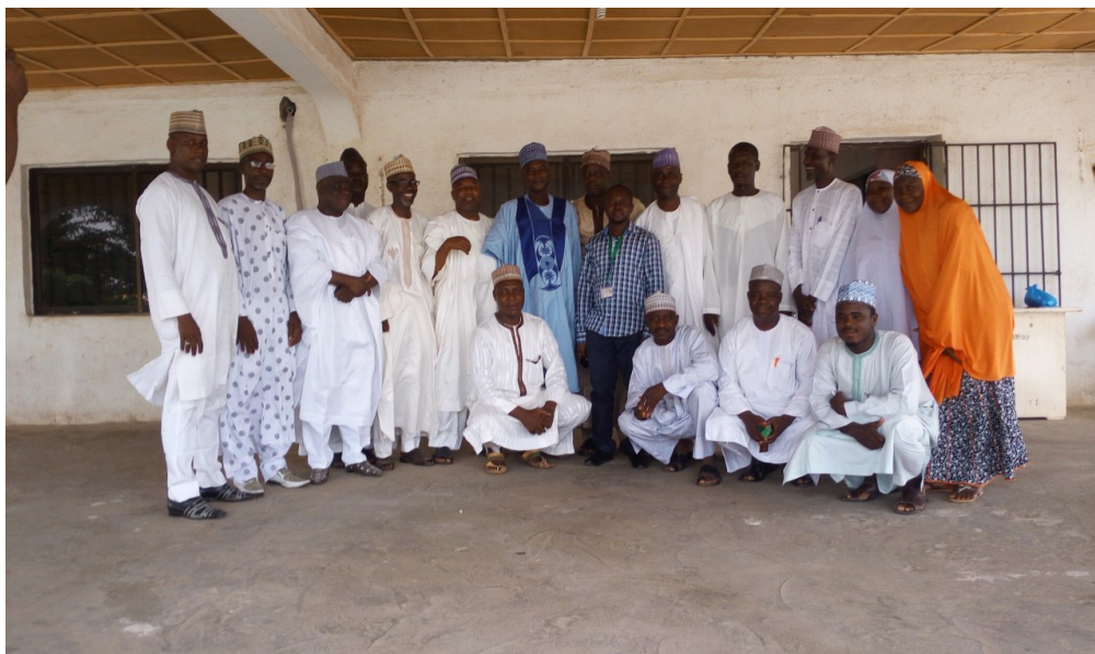
Group Photo of members of the Zamfara State BMS Code Compliance and Monitoring committee inaugurated by the State Commissioner for Health