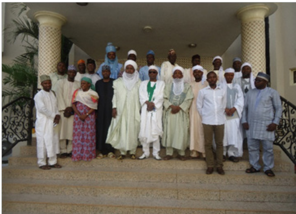
Representatives of Emirate Councils in the 5 WINNN Implementing States held in Kaduna

Similarly, the WINNN programme also held a 2 day Training of Trainers workshop for members of Ward Development Committees (WDCs) in the WINNN supported Local Governments Areas (LGAs). The workshop was focused on the Prevention of Malnutrition at the Community Level, and had in attendance representatives of the various WDCs