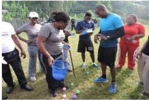
Save the Children Abuja staff preparing for ball race games