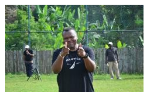
Director of Operations poses for a shot before the games