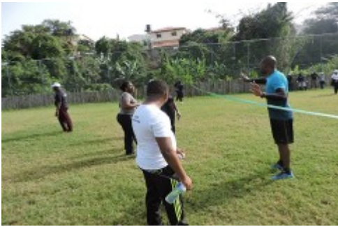
Save the Children Abuja staff preparing for one of the games