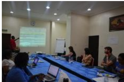
Campaign planning meeting with SCUUK held at Rock-View Hotel, Abuja