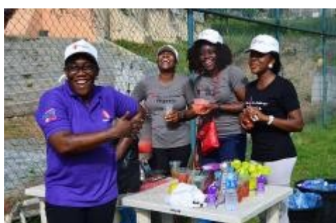
Senior HR manager poses with some colleagues