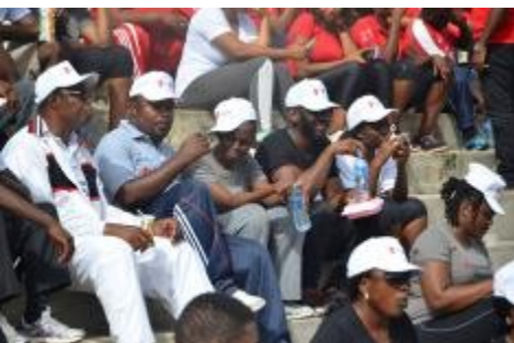
Cross section of colleagues during a health talk