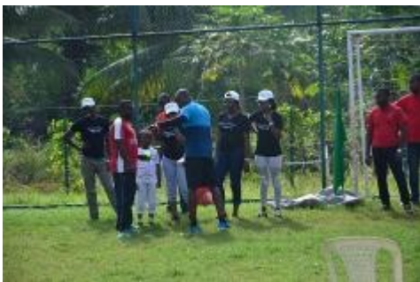
Colleagues receive instructions for fitness instructor