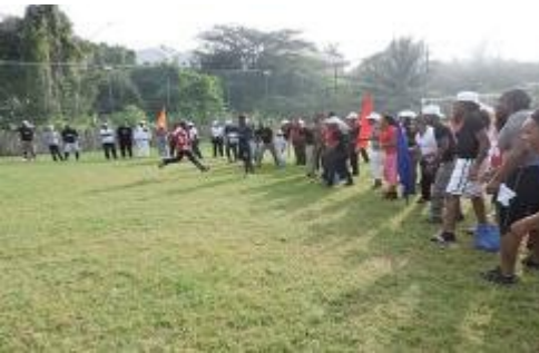
Colleagues participate in some race games