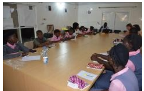
Students from GSS Gwagwalada join in the Campaign planning process for Next year campaigns