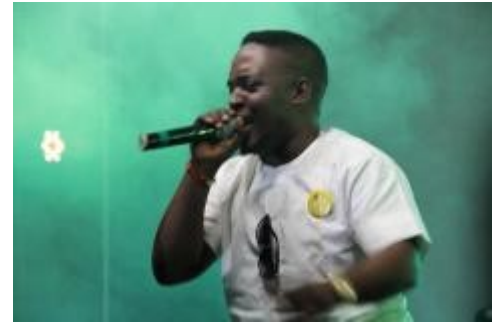
Nigeria's Music Icon, M.I at Action 2015 event in Abuja