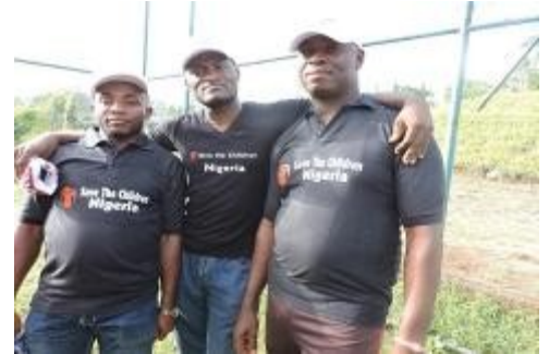
SC Abuja Colleagues pose for a shot