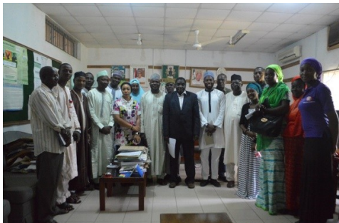
SCI Nigeria team and the media visit the Permanent Secretary Ministry of Health, Katsina State