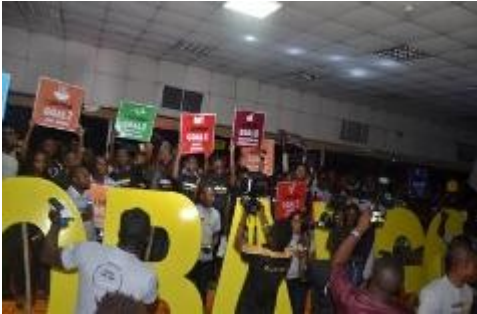
Audience at the action 2015 campaign in Lagos add their voice to the global goals recently launched