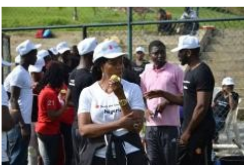
Head of Awards poses for a shot before the games