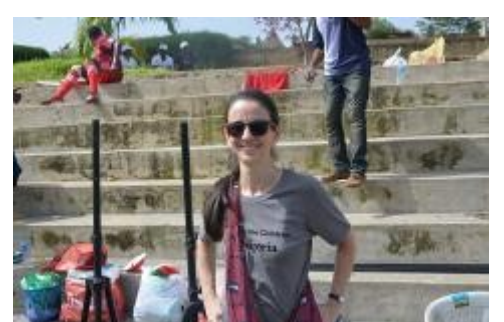
Head of Nutrition poses for a shot before the games