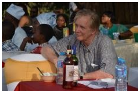
Country Director at the 2015 End of Year party