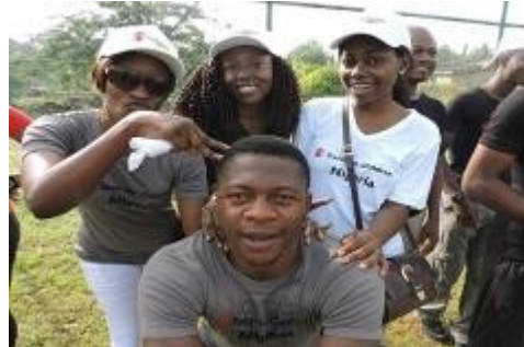
Colleagues pose for a shot