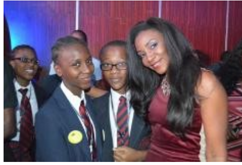
Genevieve Nnaji at the Global Day of action event