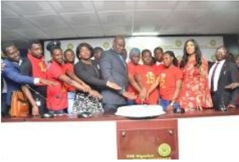
Nigerian kids cut the cake to mark the global day of action at the Nigerian Stock Exchange head office in Lagos