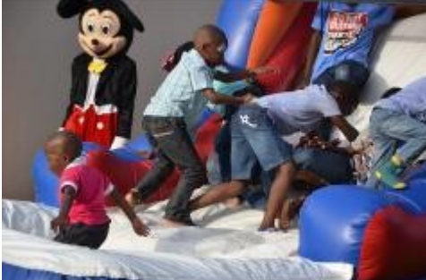
Children playing at the 2015 End of year Party