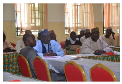
SC Nigeria partners FG & Nigerian States towards the operationalization of the National Health Act