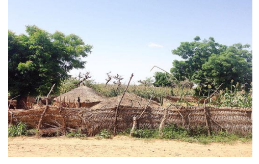
Bumbum Village Katsina State, a 30min walk to Niger Republic, Save the Children has reached out to many via WINNN