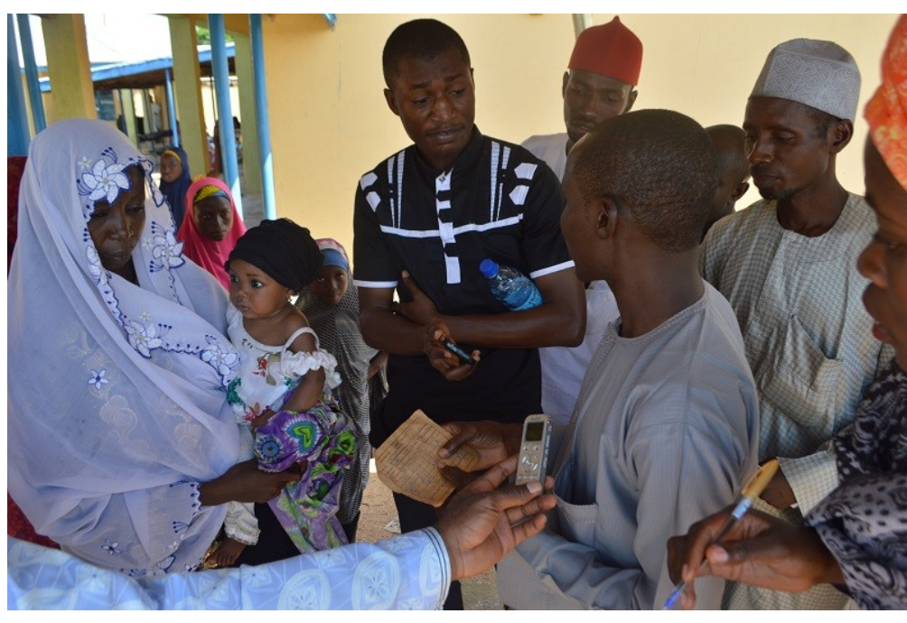
Media Interviewing Mother, a beneficiary of WINNN.

The field visit kicked off in Zamfara State with technical briefing sessions on nutrition and emphasizing how Nutrition cuts across sectors. The sessions