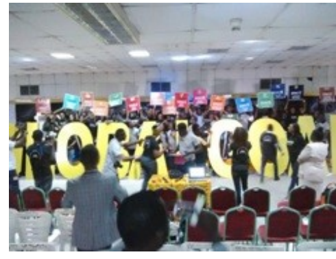
Participants preparing to light the way at the Multipurpose hall, UNILAG

All over the world, tens-of-millions of people have taken action since the start of the campaign in January 2015 to ensure that that as political leaders make decisions, they will feel the pressure of millions and millions of people calling on them to take ambitious action to secure a better future for people and planet.