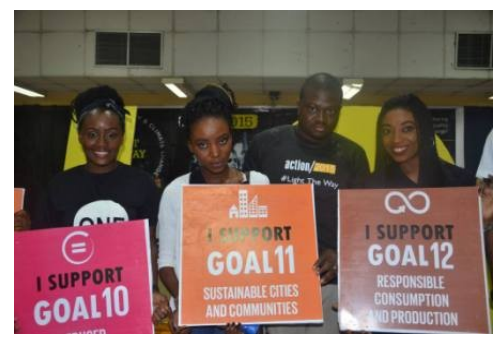
Participants at the action 2015; light the way campaign in Lagos.