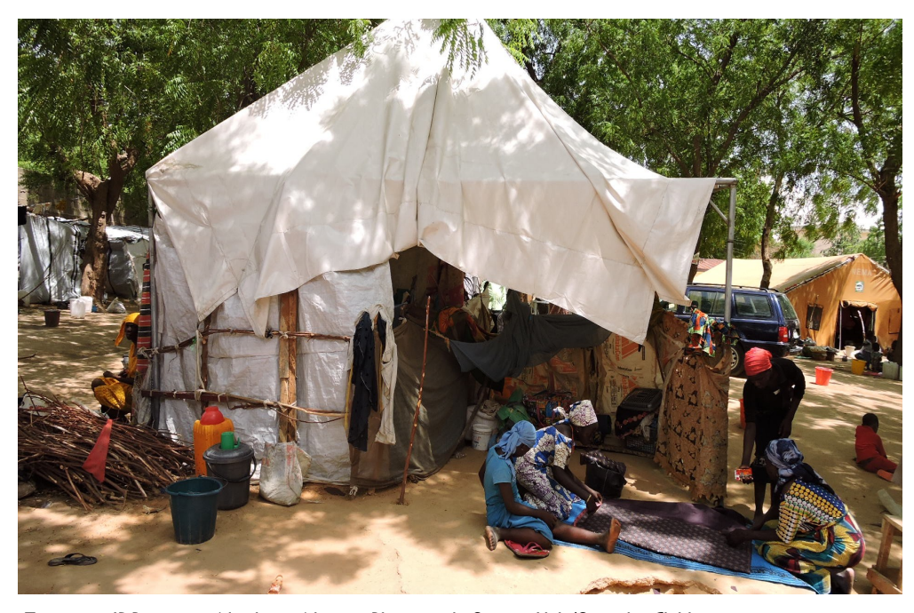
Tent in an IDP camp in Northeast Nigeria.

Save the Children is working in Borno state city of Maiduguri where more than half of the IDP population lives. The response is focusing on Child Protection, WASH, Livelihood and distribution of NFI kits in 14 camps and 10 host communities.